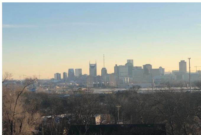
Nashville / Davidson County Parcel Viewer